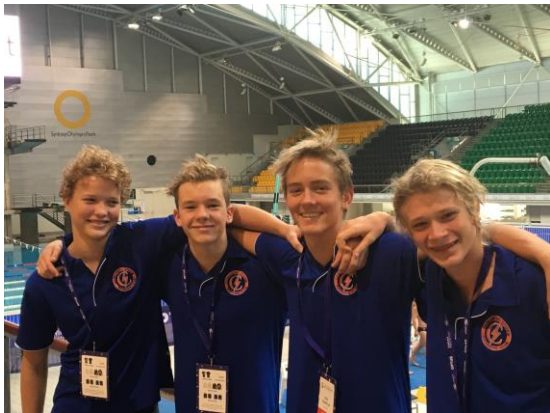
2018 Australian Age Championship Northern Territory Relay Team