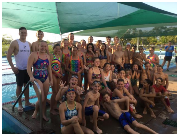
Northern Territory Swimmers Clinic