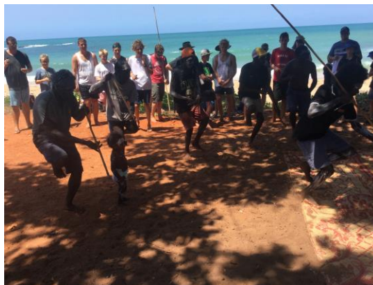
Indigenous Swim Programs